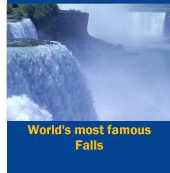
World's most famous Falls

Day 5: Enjoy a Continental Breakfast before departing for home... a perfect time to chat with your friends about all the fun things you've done, the great sights you've seen and where your next group trip will take you!