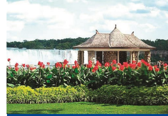
Visit beautiful Queen Victoria Park